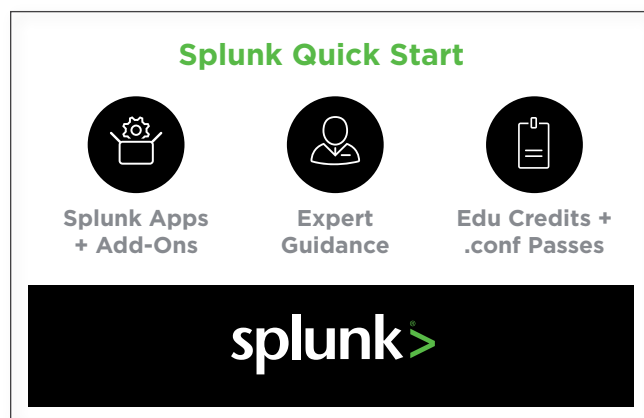
Figure 1. The Splunk Quick Start for Application Management gives you everything you need to get insights into your applications.

The Quick Start for Application Management has Splunk Apps and Add-Ons to help you find and fix problems faster and gain visibility across the entire stack ( Table 1 ).